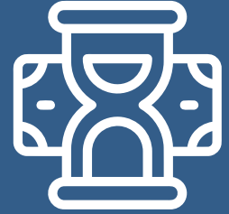
HFM Credit Deferred Payment