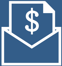
Letter of Credit