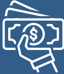
Flexible Payment in Installments